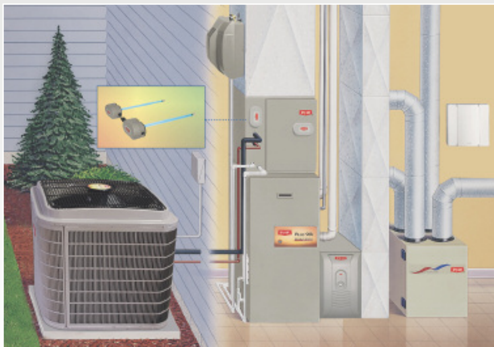
Central Air Conditioner and Gas Furnace System