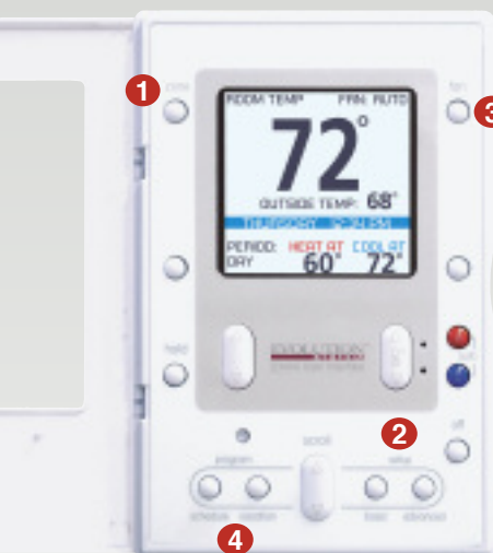
Evolution™ Zone Control